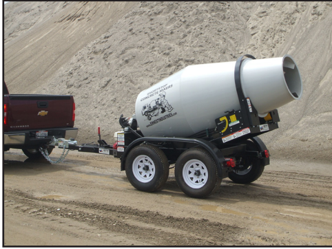
Tow To Your Jobsite