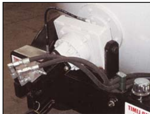
Exclusive Gimballed Mounted Drive